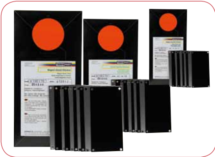
EXCLUSIVE! Pad printing clichés for laser engraving

All clichés that can be laser engraved are specially designed for lasers with a wave length of 1064 nm. Unlimited storage.