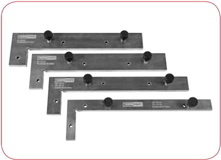
Cliché format adapter for third-party products (option)