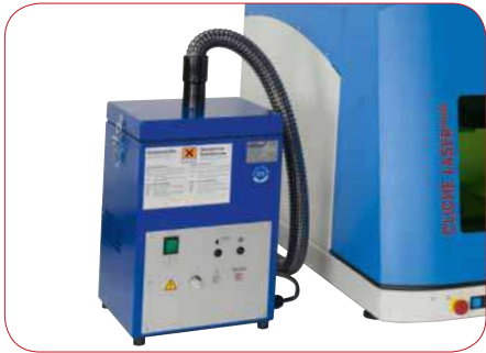
Suction and filter unit (option)