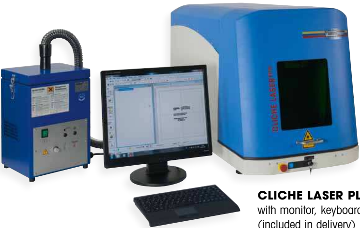
CLICHE LASER PLUS with monitor, keyboard (included in delivery) and suction and filter unit (option)