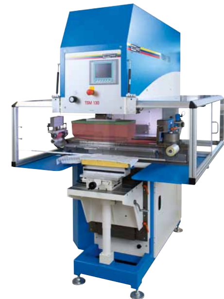
TSM 130 universal transverse doctor kit