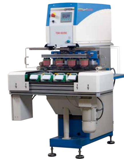
TSM 60/90 universal multiple colour kit Solo