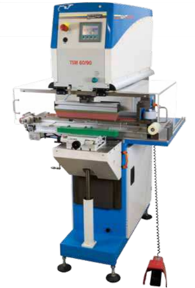
TSM 60/90 universal transverse doctor kit