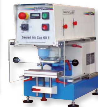
SEALED INK CUP 60 E