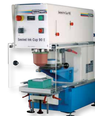
SEALED INK CUP 90 E

SEALED INK CUP 130 E, equipped with an ink residue pick-up system, aluminium profile stand and x/y cross table, is an ergonomic stand-alone workplace.