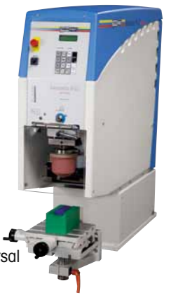
HERMETIC 9-12 universal