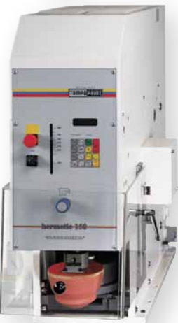
HERMETIC 13-12 universal

Accessories: "Service Unit" – the flexible carriage