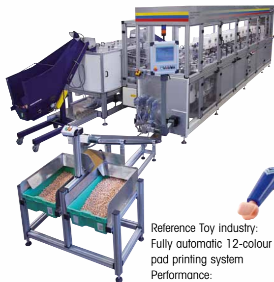
Reference Toy industry: Fully automatic 12-colour pad printing system Performance: 24.000 printing parts/h