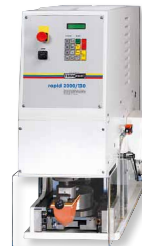
RAPID 2000/130 Floor standing model