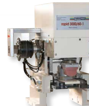
RAPID 3000/60-1 Built-in model for automations, for external drive