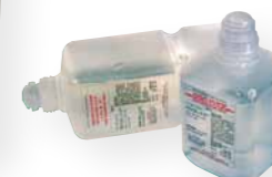
Fully automatic 5-colour pad printing system