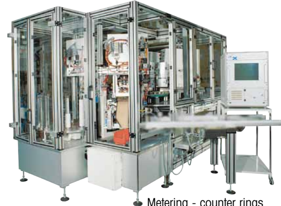
Metering - counter rings