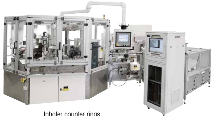
Inhaler counter rings