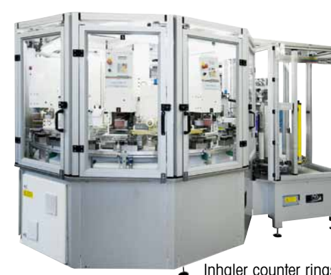
Inhaler counter rings