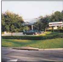
TAMPOPRINT® International Corporation, USA subsidiary since 1994 www.tampoprint.com