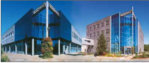
TAMPOPRINT® Special machine construction since 1978