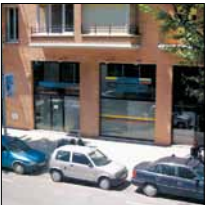
TAMPOPRINT® IBERIA S.A.U., Spain subsidiary since 2000 www.tampoprint.es