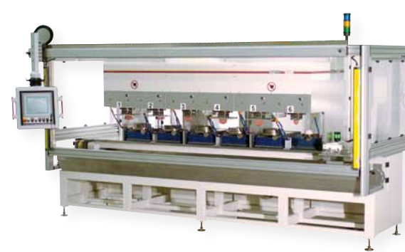
Linear automation with highspeed servo axis