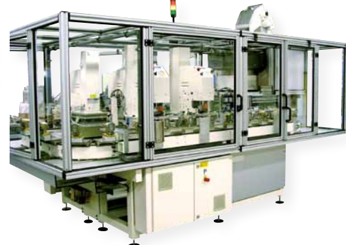
4 colour automation with feeding