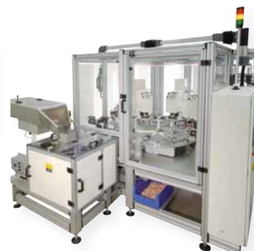
2 colour automation