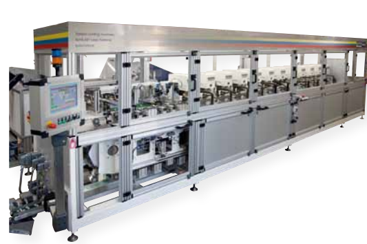
10 colour linear automation

We are your reliable partner for all industrial marking and decorating requirements